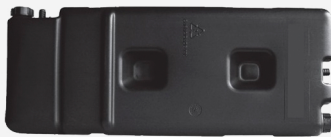
WATER TANK 16 liters