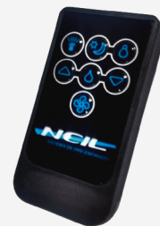
REMOTE CONTROL (OPTIONAL)