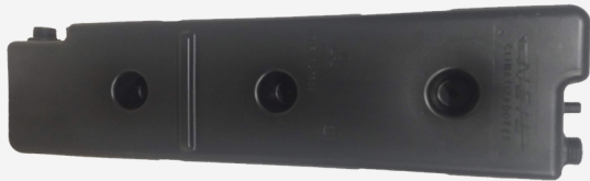
WATER TANK 16 liters